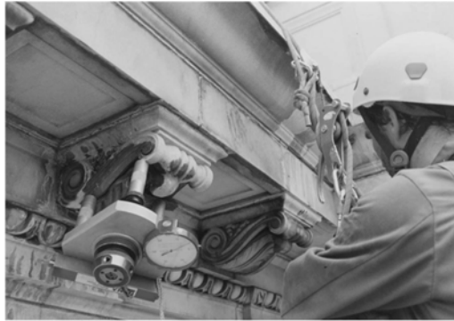
Figure 7 – Case Study 6

Rope Access technicians removed loose modillions, and the balance of the modillions were anchored to the backup and load tested (Figure 7).