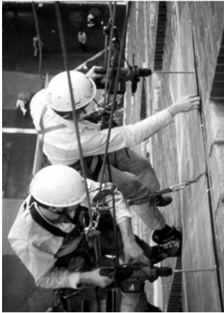
Figure 5 – Case Study 4

Initially, hands-on inspection of the exterior facade of a 12-story tall, ornamental and historic building occupying an entire city block was completed in four days utilizing Rope Access. Deteriorated conditions of the exterior facade and potential vibration damage from the adjoining construction activity made the need for emergency stabilization of the facade a necessity. Excavation at two sides of the building, a deep wood-framed cornice and lack of proper tie-backs prevented the use of scaffolding, boom truck, or lifts for the repairs. Rope Access technicians implemented the engineers' emergency stabilization and temporary repairs (Figure 5) (removing loose debris, stitching, netting, and banding displaced and cracked masonry) economically and efficiently.