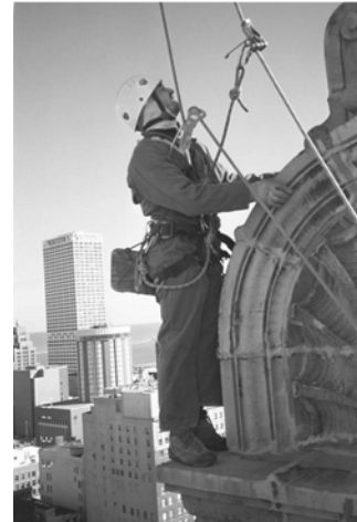
Figure 3 - Case Study 2