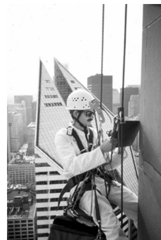
Figure 4 – Case Study 3

Rope Access facilitated a successful hands-on inspection (Figure 4) of defects on the exterior facade of a 185-m tall building. Existing house rigs were not operational, and the mast-climbing scaffolding, installed for the facade repairs, could not be operated due to a city-wide ban on the use of these platforms. Rope Access was also used to perform weld inspections on the radio antenna above the same building, 265-m above the ground, and perform the interior inspection of the 185-m chimney liner in the building. The antenna and chimney inspections were performed over a weekend to minimize down time to the radio antenna and the building's heating system.