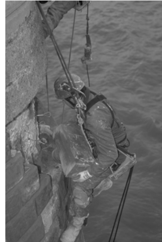
Figure 8 – Case Study 7