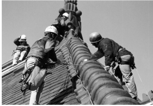
Figure 2 - Case Study 1