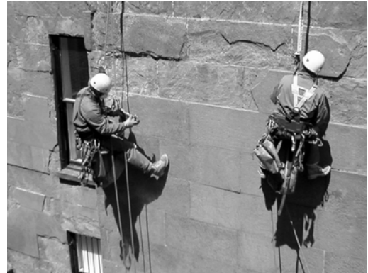
Figure 6 – Case Study 5

The building, located in an historic section of the city, is five stories and about 25-m tall with a mansard roof. The exterior walls are load-bearing masonry faced on the exterior with brownstone and brick. During a condition survey of the exterior building envelope, engineers identified loose and incipient spalls in the brownstone on the two street elevations and to the rear of the building. Under direction of the engineers, Rope Access technicians performed a hands-on inspection and removed loose and incipient spalls (Figure 6).